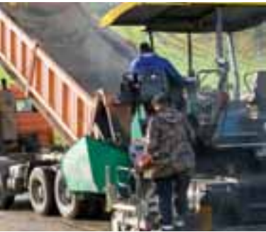
4 Powerful and economical: Many renowned manufacturers of mobile machinery count on modern engine technology from DEUTZ