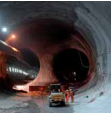
12 Gigantic tunnelling projects make for global attention. DEUTZ engines are there when the breakthrough happens