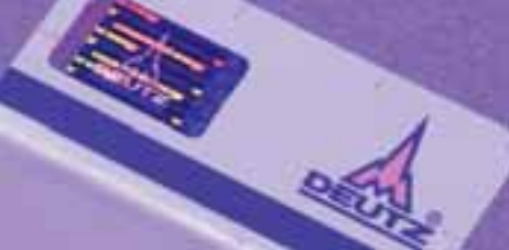
UV light clearly shows up the security features

On the new part number label the colour of the hologram changes as it is viewed from a different angle. Under black light the DEUTZ logo changes colour and appears in red. Along the edges of the part number tag there is a perforation that prevents the security label from being detached.