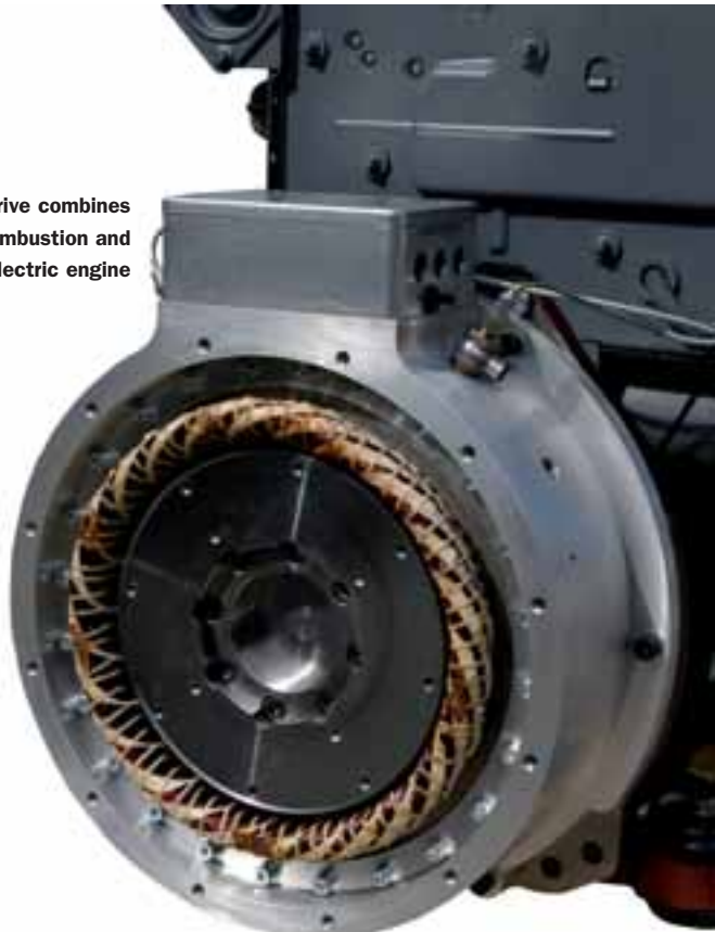
The hybrid drive combines internal combustion and electric engine

considerably, depending on the application. The additional power of the electric motor enables the diesel engine to be made smaller – so-called downsizing – without entailing any reduction in the equipment's power. A smaller diesel engine means reduced consumption and, thus, also reduced emissions. Exhaust gas after-treatment is also simplified. Moreover, depending on the powertrain model, temporary emission-free operations are also possible. DEUTZ is aiming to use the hybrid drive to exploit these opportunities in the mobile machinery segment. Applications with high peak performance but a lower mean load are the target for the innovative drive design. On that basis, the developers expect that the hybrid engine will be used for wheel loaders, stackers, aircraft movers and telescopic loaders. One can also envisage them being fitted in equipment such as excavators or scrap sorters. In view of the high full load ratio, DEUTZ's experts believe that it would, as yet, be unwise to fit them in compactors, tractors and drilling equipment.