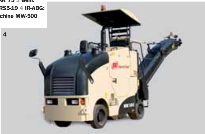
1 Liebherr: Crawler R 313 Litronic 2 Atlas Weyhausen: Wheel loader AR 75 3 Gehl: Telescopic loader RS5-19 4 IR-ABG: Cold milling machine MW-500