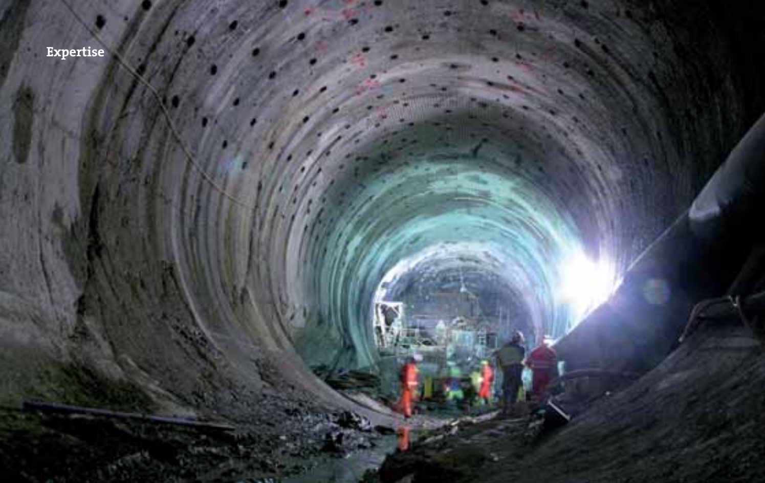
Tunnelling work at Amsteg (Switzerland): huge machines cut away at the mountain to create the new Gotthard Base Tunnel