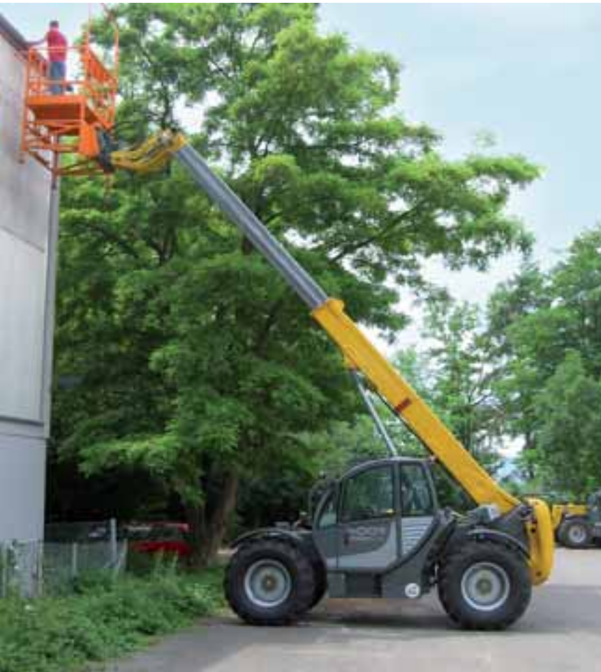
Wherever the experts expect top performance it can rely on telescopic loaders from Kramer

Andreas Breunig, Product Manager at Kramer: "The telescope range has been designed for power and speed." Thanks to the all-wheel steering, they can almost turn on the spot. In addition, the lifting arm can be retracted completely into the U-shaped frame, allowing the operator clear vision. The top model 4009 with a loading height of nine meters and a net load of up to four tonnes can prove its capabilities especially at building construction sites. With a longer wheelbase