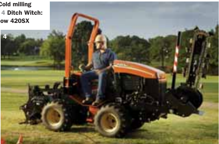
1 Vögele: Road paver Super 1300-2 2 Bomag: Compactor BW 236 DI-4 BVC 3 Wirtgen: Cold milling machine W 100 4 Ditch Witch: Vibratory plow 420SX

developed a piece of machinery which, with a height of only 1.95 metres and a turning circle of 3.35 metres, can demonstrate its strengths where space is restricted. Even inside buildings, halls, underground car parks and other locations with restricted space, the boom, which can be extended up to 5.8 metres, can carry loads of up to 2.5 tons with no problem at all. Thanks to the different attachments, the telescopic boom cannot only be used in construction engineering, but also in agricultural applications and by other service providers. When motorising its equipment the Gehl company puts its faith in a 4-cylinder DEUTZ 2009 series engine with 48 kW at 2,600 min -1 , that helps the compact machine achieve an all-round, convincing performance.