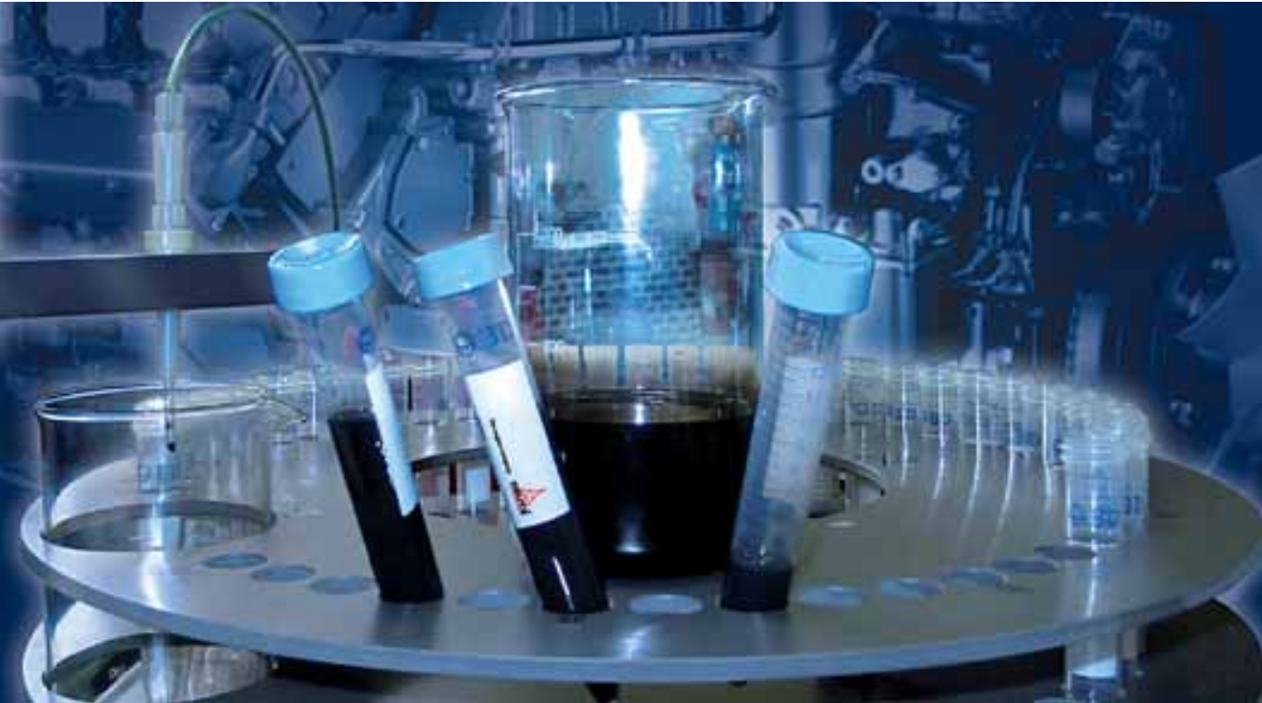
Extended maintenance intervals by the newly developed oil diagnosis system