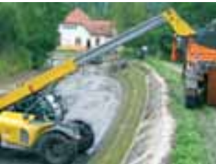
11 Versatile: Telescopic loaders with an extendable lifting arm