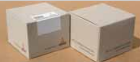
New standardised packaging for DCE and DPS

Since 2006 the dispatch boxes for DEUTZ Compact Engines (DCE) and DEUTZ Power Systems (DPS) have a standardised design. The four outer sides have the relevant logo and the slogans "The Engine Company" (DCE) and "Concentrated Energy" (DPS) printed on them.